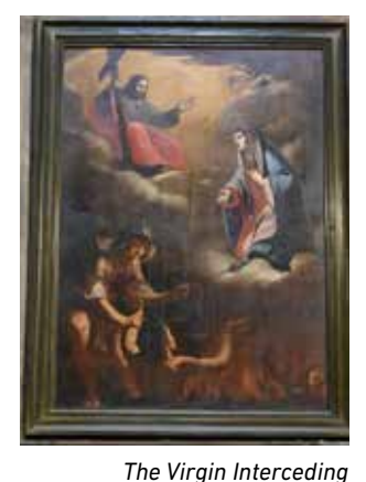
for the Souls in Purgatory, oil on canvas, 225 x 160 cm