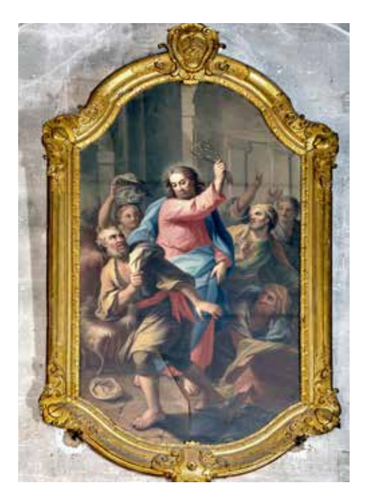
APT Cathedral of Sainte Anne Rue de la Cathédrale 84400 Apt