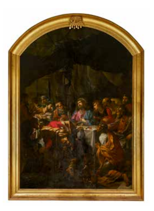
Jean Daret (Brussels, 1614 - Aix-en-Provence, 1668)

Cathedral of Saint Sauveur 28 Pl. des Martyrs de la Résistance 13100 Aix-en-Provence