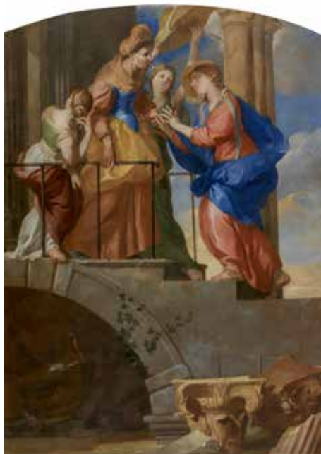
Pierre Puget (1620-1694)

17 rue Gaston de Saporta 13100 Aix-en-Provence