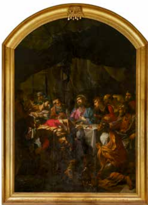
Jean Daret (Brussels, 1614 - Aix-en-Provence, 1668)

Cathedral of Saint Sauveur 28 Pl. des Martyrs de la Résistance 13100 Aix-en-Provence